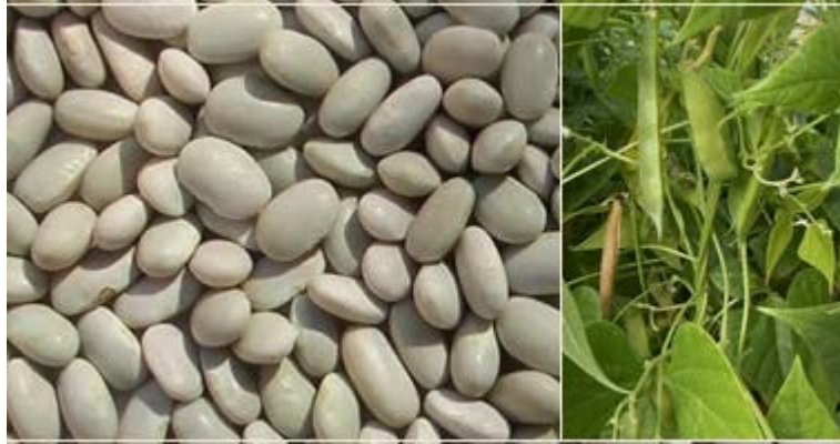
White Tepary Beans