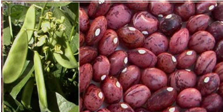
Dixie Speckled Butter Peas - Phaseolus lunatus