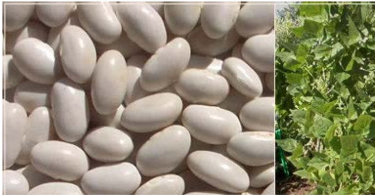
Little White Ice Beans ( Phaseolus vulgaris )