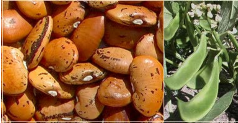
Hopi Yellow Lima Beans - "Sikyahatiko" - Phaseolus lunatus

Lima bean is a cool season vegetable requiring dry and cool climate with an average rainfall of 50-62.5 cm. Compared to other legumes, it is a long duration crop and is retained in field for 9 months. Lima bean is an important crop in Maharashtra.