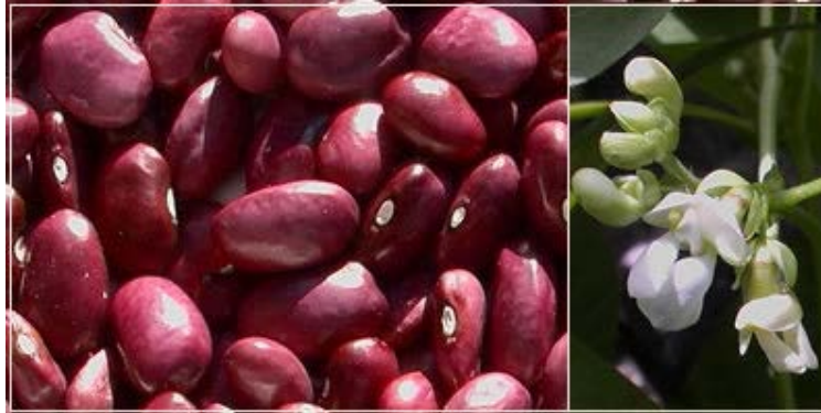
Purple Beans ( Phaseolus vulgaris )