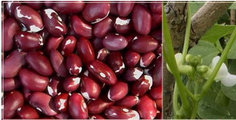
Anasazi Beans( Phaseolus vulgaris )

Apply 25 of FYM and 50 kg P and 25 kg K/ha as basal dose. 25 kg N and 25 kg of K/ha are applied between 20-25 days after sowing and application of remaining 25 kg of N is done between 40-45 days.