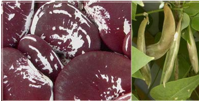
Christmas Lima Beans - Phaseolus lunatus