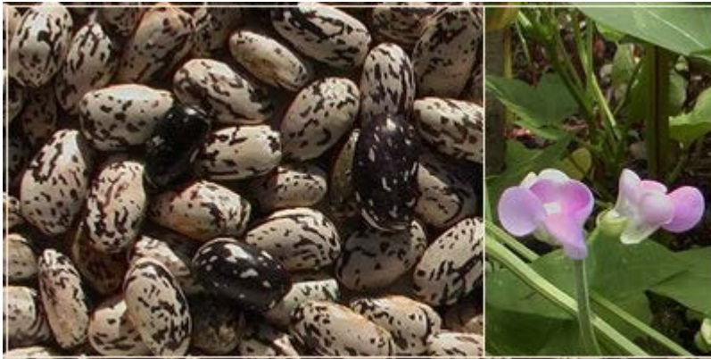
Hopi Black Pinto Beans ( Phaseolus vulgaris )